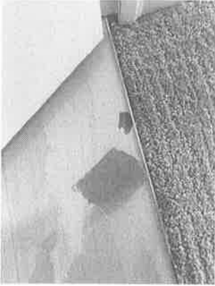
170186 - 1 - IMG_7539 - scratches in fixed windows at stairs