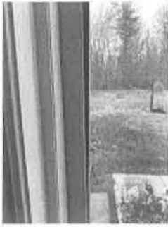
Left side 3.jpg 635K