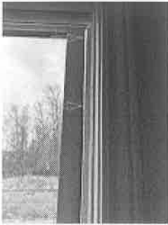
Right side 1.jpg 426K