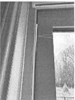
Left side 2.jpg 471K