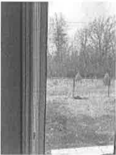
Glass 4.jpg 848K