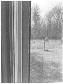
Glass 3.jpg 715K