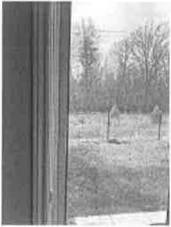
Glass 4.jpg 848K