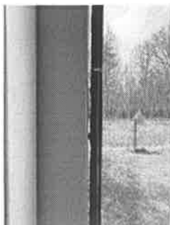
Glass 2.jpg 657K