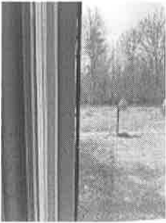
Glass 3.jpg 715K