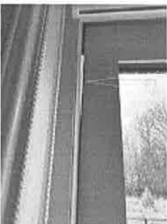
Left side 2.jpg 471K