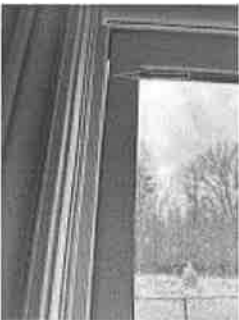
Left side 1.jpg 452K