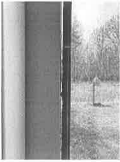
Glass 2.jpg 657K