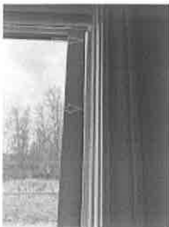
Right side 1.jpg 426K