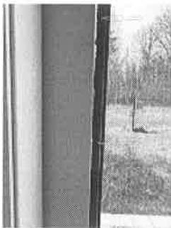
Glass 1.jpg 667K