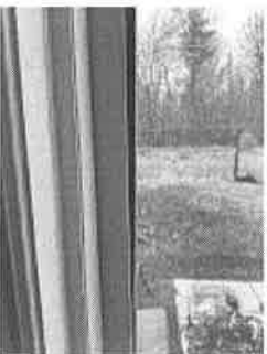
Left side 3.jpg 635K