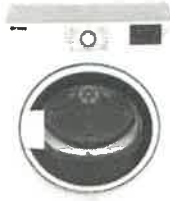
24" Dryer DV7600WW