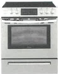
30" Range, Smooth top Frigidaire CFEH3054U