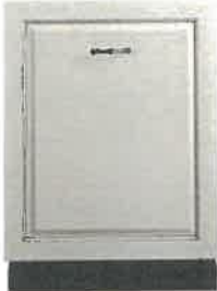
24" Dishwasher (Panel Ready) GBT412SIM1