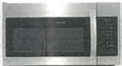
30" Over The Range Microwave Frigidaire FFMV1846VS