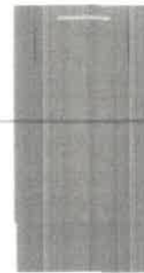
18" Dishwasher (Panel Ready) UDT518SAHP