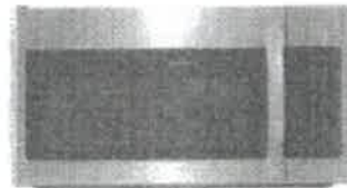
30" Over The Range Microwave Frigidaire FFMV1846VS