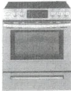
30" Range, Smooth top Frigidaire CFEH3054U