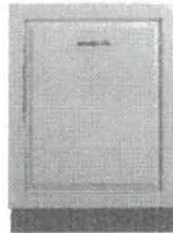
24" Dishwasher (Panel Ready) GBT412SIM1