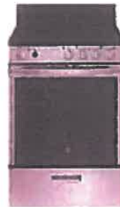
24" Range, Smooth top GE - JCAS640RMSS