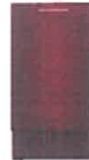
(Panel Ready) UDT518SAHP