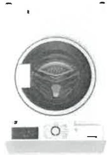
24" Washer WM7200WW