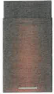
18" Dishwasher (Panel Ready) UDT518SAHP