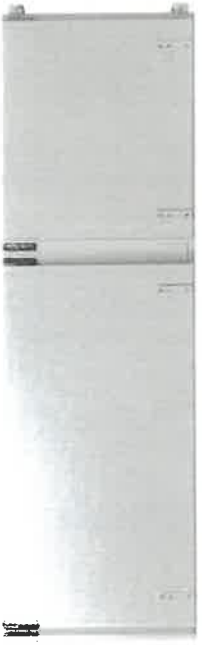
24" Fridge (Panel Ready) GE - M2E9PPMKII