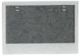
24" Over The Range Microwave Haier HMV1472BHS