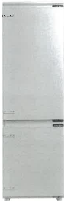
24" Fridge (Panel Ready) GE - M2E9FPMKII