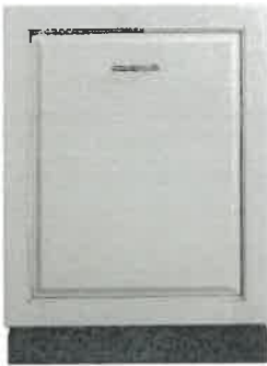
24" Dishwasher (Panel Ready) GBT412SIM1