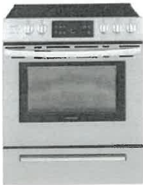
30" Range, Smooth top Frigidaire CFEH3054U