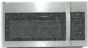
30" Over The Range Microwave Frigidaire FFMV1846VS