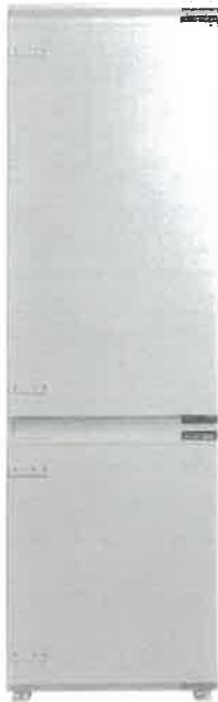
24" Fridge (Panel Ready) GE - M2E9FPMKII