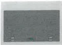
24" Over The Range Microwave Haier HMV1472BHS