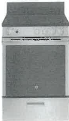
24" Range, Smooth top GE – JCAS640RMSS