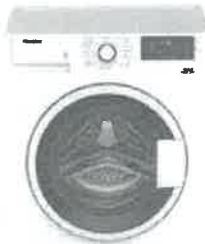
24" Washer WM7200WW