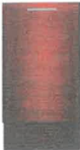
18" Dishwasher (Panel Ready) UDT518SAHP