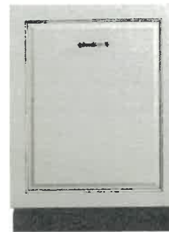
24" Dishwasher (Panel Ready) GBT412SIM1