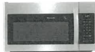
30" Over The Range Microwave Frigidaire FFMV1846VS