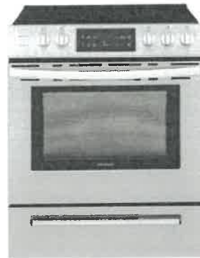
30" Range, Smooth top Frigidaire CFEH3054U