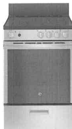
24" Range, Smooth top GE - JCA5640RMSS