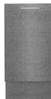
18" Dishwasher (Panel Ready) UDT518SAHP