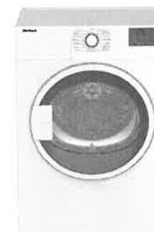
24" Dryer DV7600WW