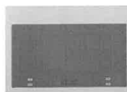
24" Over The Range Microwave Haier HMV1472BHS