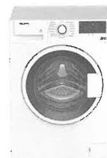
24" Washer WM7200WW