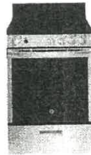
24" Range, Smooth top GE - JCA5640RMSS