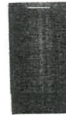
(Panel Ready) UDT518SAHP