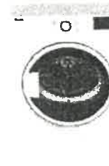
24" Dryer DV7600WW

Products photos may not be exact and are subject to change without notice with equal or better value. E & O.E.