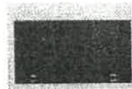
24" Over The Range Microwave Haier HMV1472BHS