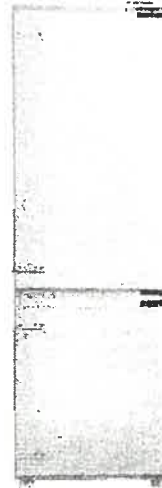
24" Fridge (Panel Ready) GE - M2E9FPMKII