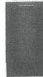
(Panel Ready) UDT518SAHP