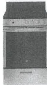
24" Range, Smooth top GE - JCAS640RMSS