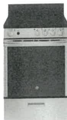
24" Range, Smooth top GE - JCAS640RMSS