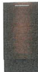
(Panel Ready) UDT518SAHP