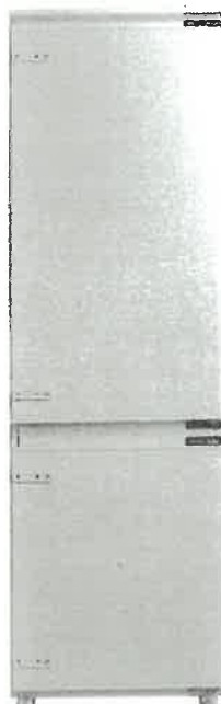
24" Fridge (Panel Ready) GE - M2E9FPMKII