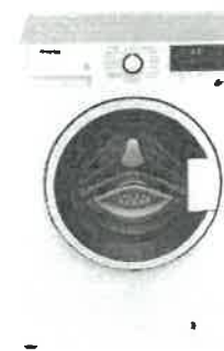
24" Washer WM7200WW