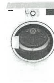
24" Dryer DV7600WW