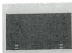
24" Over The Range Microwave Haier HMV1472BHS