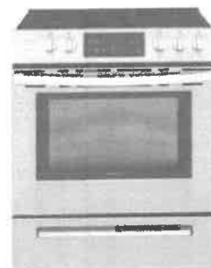
30" Range, Smooth top Frigidaire CFEH3054U