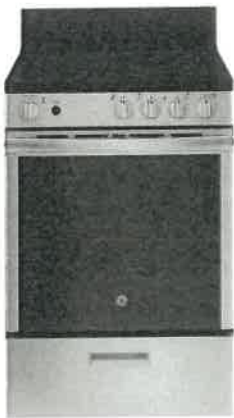
24" Range, Smooth top GE – JCA5640RMSS