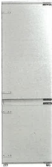
24" Fridge (Panel Ready) GE - M2E9FPMKII