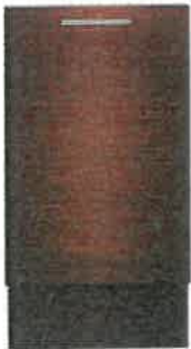
(Panel Ready) UDT518SAHP