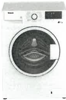
24" Washer WM7200WW