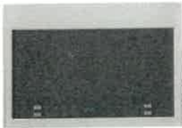
24" Over The Range Microwave Haier HMV1472BHS