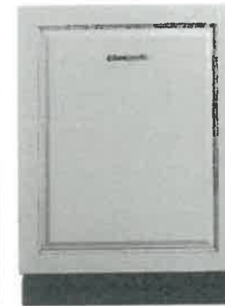
24" Dishwasher (Panel Ready) GBT412SIM1