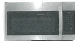
30" Over The Range Microwave Frigidaire FFMV1846VS