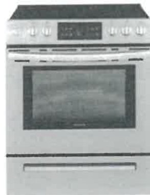
30" Range, Smooth top Frigidaire CFEH3054U