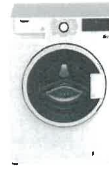
24" Washer WM7200WW