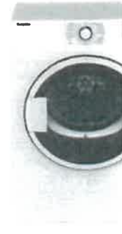
24" Dryer DV7600W