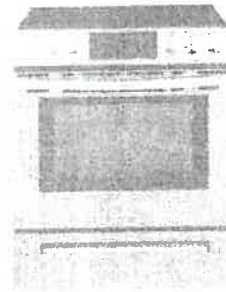
30" Range, Smooth top Frigidaire CFEH3054U