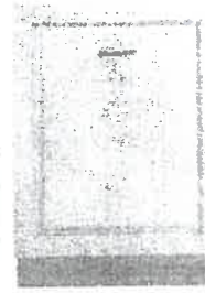
24" Dishwasher (Panel Ready) GBT412SIM1