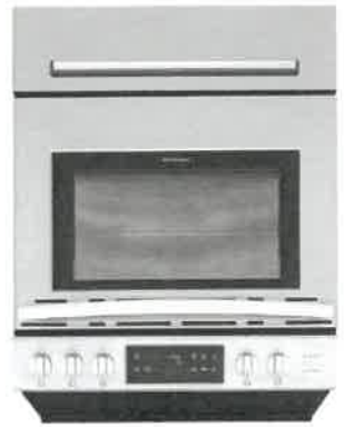
30" Range, Smooth top Frigidaire CFEH3054U