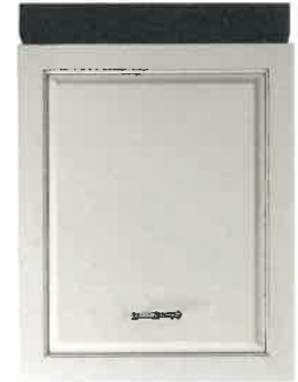
24" Dishwasher (Panel Ready) GBT412SIM1