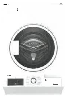
24" Washer WM7200WW