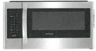
30" Over The Range Microwave Frigidaire FFMV1846VS