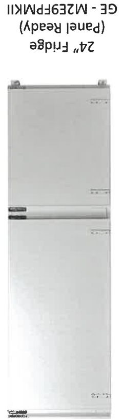
24" Fridge (Panel Ready) GE - M2E9FPMKII