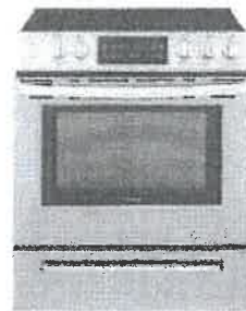
30" Range, Smooth top Frigidaire CFEH30S4U