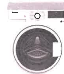
24" Washer WM7200WW