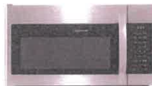
30" Over The Range Microwave Frigidaire FFMV1846VS