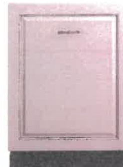
24" Dishwasher (Panel Ready) GBT412SIM1