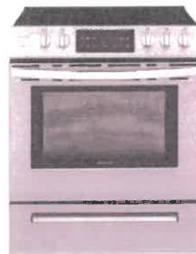
30" Range, Smooth top Frigidaire CFEH3054U