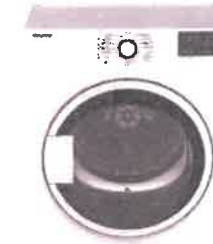
24" Dryer DV7600WW