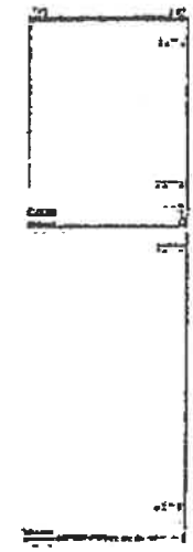
24" Fridge (Panel Ready) GE - MZ9FPMKII