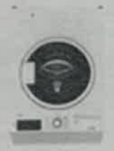
24" Washer WMF7200WW