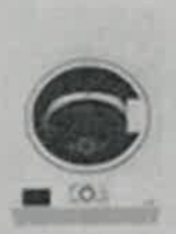
24" Dryer DVF600WW

Product photos may not be exact and are subject to change without notice or better view. 1 & 02