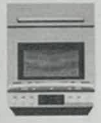
30" Range, Smooth top Frigidaire CFH3054U