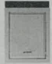
24" Dishwasher (Panel Ready) GE4125M1