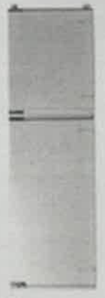
24" Fridge (Panel Ready) GE - KJCE9PMXJ