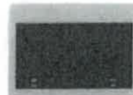
24" Over The Range Microwave Haier HMV1472BHS