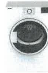
24" Dryer DV7600WW

Products photos may not be exact and are subject to change without notice with equal or better value. E & O.E.