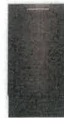
18" Dishwasher (Panel Ready) UDT518SAHP