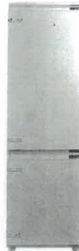
24" Fridge (Panel Ready) GE - M2E9FPMKII