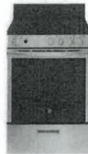
24" Range, Smooth top GE - JCAS640RMSS