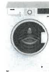
24" Washer WM7200WW