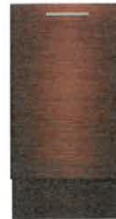
(Panel Ready) UDT518SAHP 18" Dishwasher