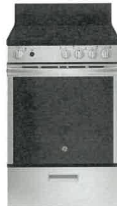
24" Range, Smooth top GE – JCAS640RMSS