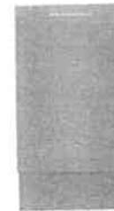
18" 24" Dishwasher (Panel Ready) UDT518SAHP