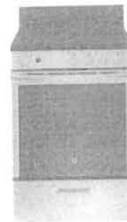
24" Range, Smooth top GE – JCAS640RMSS