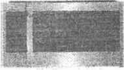
30" Over The Range Microwave Frigidaire FFMV1846VS