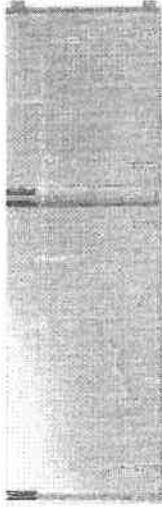
24" Fridge (Panel Ready) GE - MZE9FPMKII