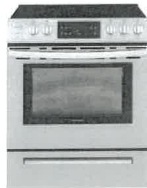
30" Range, Smooth top Frigidaire CFEH3054U