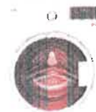
24" Washer WM7200WW