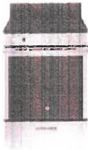
24" Range, Smooth top GE - JCA5640RMSS