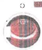
24" Dryer DV7600WW