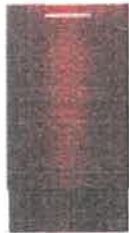
19" 24" Dishwasher (Panel Ready) UDT518SAHP