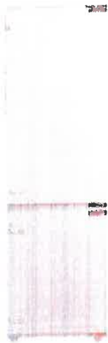
24" Fridge (Panel Ready) GE - MZE9FPMKII