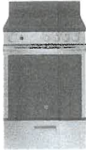
24" Range, Smooth top GE - JCAS640RMSS