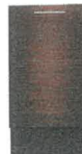
18" 24" Dishwasher (Panel Ready) UDT518SAHP