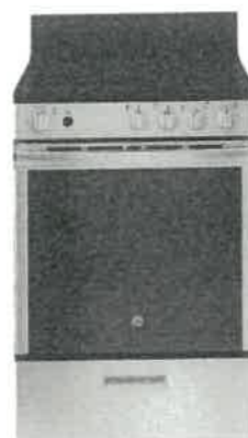
24" Range, Smooth top GE - JCAS640RMSS