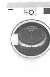
24" Dryer DV7600WW