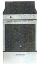
24" Range, Smooth top GE - JCA5640RMSS