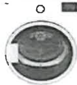
24" Dryer DV7600WW