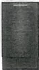
(Panel Ready) UDT518SAHP 18" Dishwasher