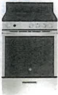
24" Range, Smooth top GE - JCA5640RMSS