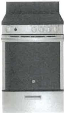
24" Range, Smooth top GE – JCAS640RMSS