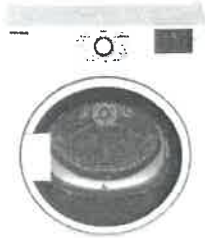
24" Dryer DV7600WW