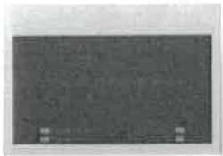
24" Over The Range Microwave Haier HMV1472BHS