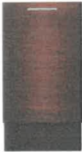
18" Dishwasher (Panel Ready) UDT518SAHP