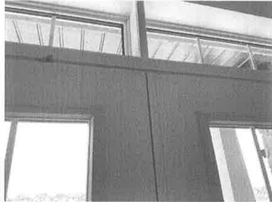
159066 - 1 - WINDOWS~DAMAGED WINDOW ON RIGHT OPERATING WINDOW