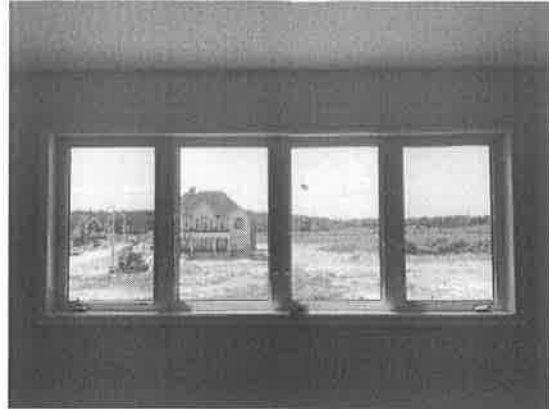
159058 - 3 - WINDOWS~STRESS CRACK AT BOTH MIDDLE FIX WINDOWS