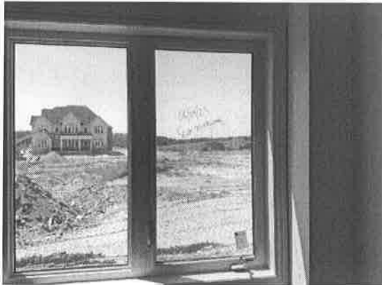
159066 - 2 - WINDOWS~DAMAGED WINDOW ON RIGHT OPERATING WINDOW