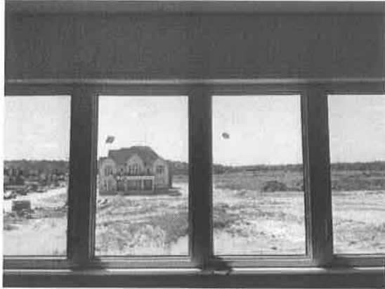
159155 - 1 - FRONT DOORS~DENT ON RIGHT FIXED DOOR AT TOP.