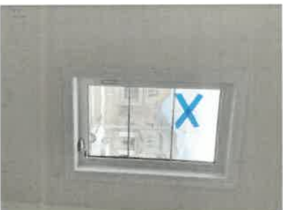
160983 - 2 - WINDOWS~CRACKED GLASS RIGHT OPERATING WINDOW