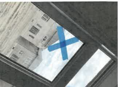
160977 - 1 - FRONT DOORS~WEATHER STRIP AT FRONT DOOR NOT INSTALLED.