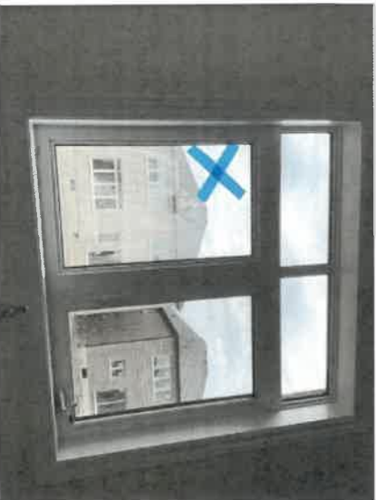
160976 - 2 - WINDOWS~CRACK AT LEFT FIX GLASS ABOVE SINK