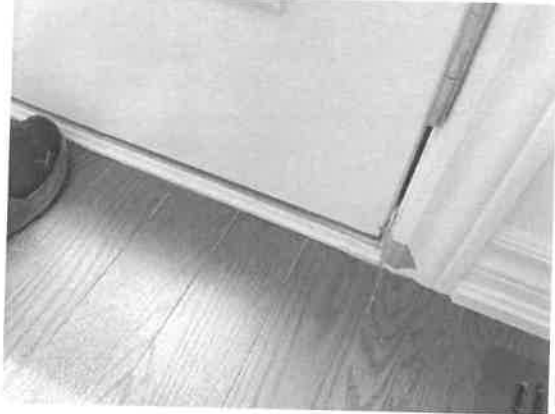
160388 - 1 - TRIM~CUT TRIM SLOPE BETTER LEFT SIDE AT TILE SO GAP NOT AS BIG.