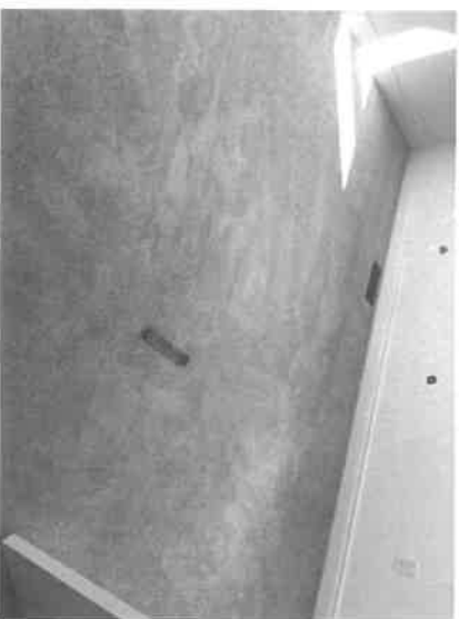
159648 - 1 - FLOORING~INSPECT/REMOVE DIRT ON CARPET MARKED WITH GREEN TAPE