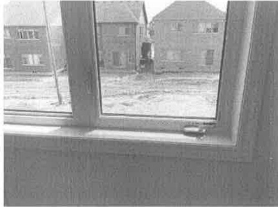
157164 - 1 - WINDOWS~RIPPED SCREEN