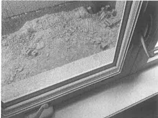
157164 - 2 - WINDOWS~RIPPED SCREEN