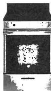
24" Range, Smooth top GE - JCAS640RMSS