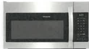
30" Over The Range Microwave Frigidaire FFMV1846VS