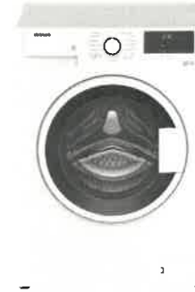
24" Washer WM7200WW