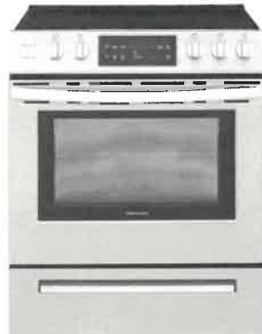
30" Range, Smooth top Frigidaire CFEH3054U