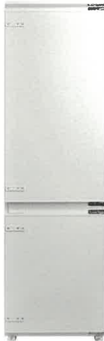
24" Fridge (Panel Ready) GE - M2E9FPMKII