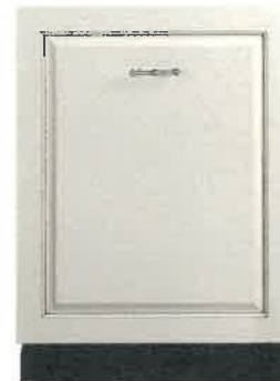
24" Dishwasher (Panel Ready) GBT412SIM1