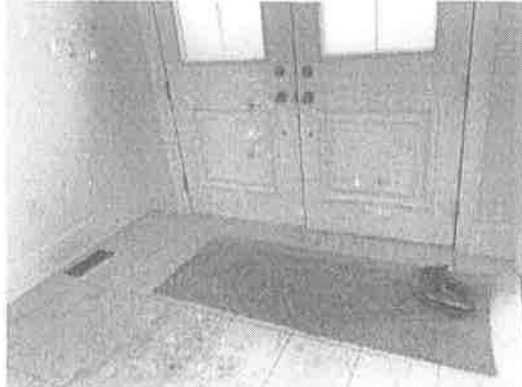
152085 - 2 - FRONT DOORS~OPERATING RIGHT DOOR DAMAGED AT BOTTOM SEE PHOTO