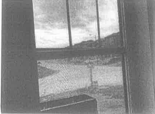
152085 - 1 - FRONT DOORS~OPERATING RIGHT DOOR DAMAGED AT BOTTOM SEE PHOTO