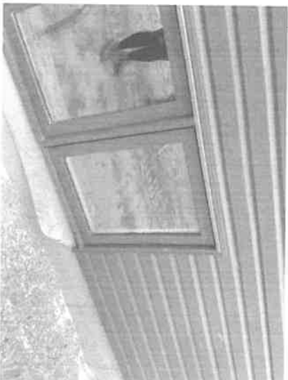
153893 - 1 - NOTE:~SCRATCH ON EXTERIOR WINDOW MULIN LEFT OFF FRONT PORCH