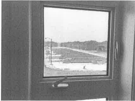
154086 - 2 - WALLS~WINDOW SCREEN NOT INSTALLED AT OPERATING WINDOW