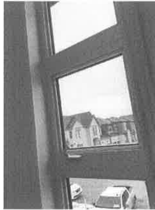
154097 - 1 - FRONT DOORS~CHIPS ON ASTRICAL