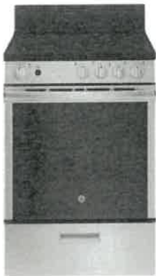
24" Range, Smooth top GE – JCAS640RMSS