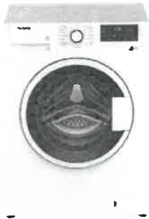
24" Washer WM7200WW