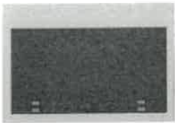
24" Over The Range Microwave Haier HMV1472BHS