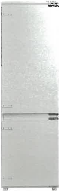
24" Fridge (Panel Ready) GE - M2E9FPMKII