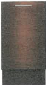
(Panel Ready) UDT518SAHP