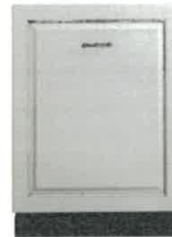
24" Dishwasher (Panel Ready) GBT412SIM1