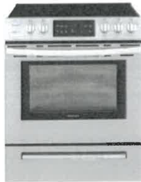
30" Range, Smooth top Frigidaire CFEH3054U