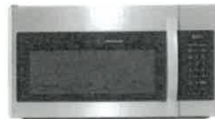
30" Over The Range Microwave Frigidaire FFMV1846VS