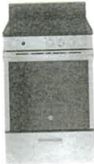
24" Range, Smooth top GE - JCAS640RMSS