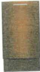
(Panel Ready) UDT518SAHP