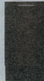
(Panel Ready) UDT518SAHP