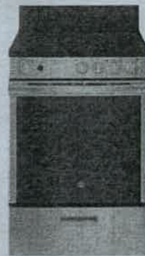
24" Range, Smooth top GE - JCAS640RMSS