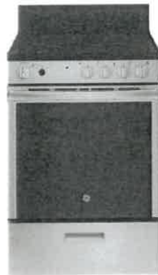
24" Range, Smooth top GE – JCAS640RMSS