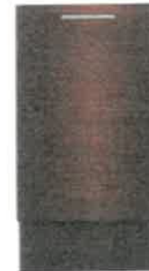
(Panel Ready) UDT518SAHP