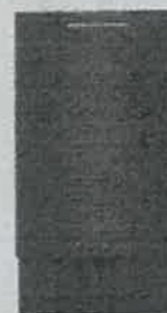
(Panel Ready) UDT518SAHP