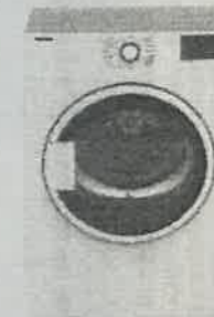
24" Dryer DV7600WW

Products photos may not be exact and are subject to change without notice with equal or better value. E & O.E.