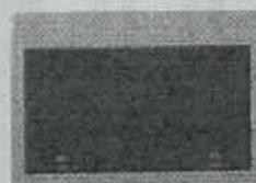
24" Over The Range Microwave Haier HMV1472BHS